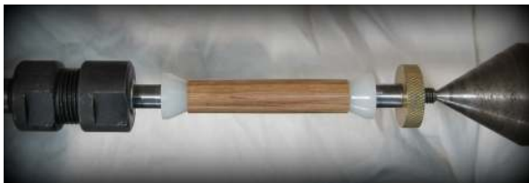
Example shown: Sierra pen blank.

Examples of pen blanks mounted on Finishing Cones are shown below.